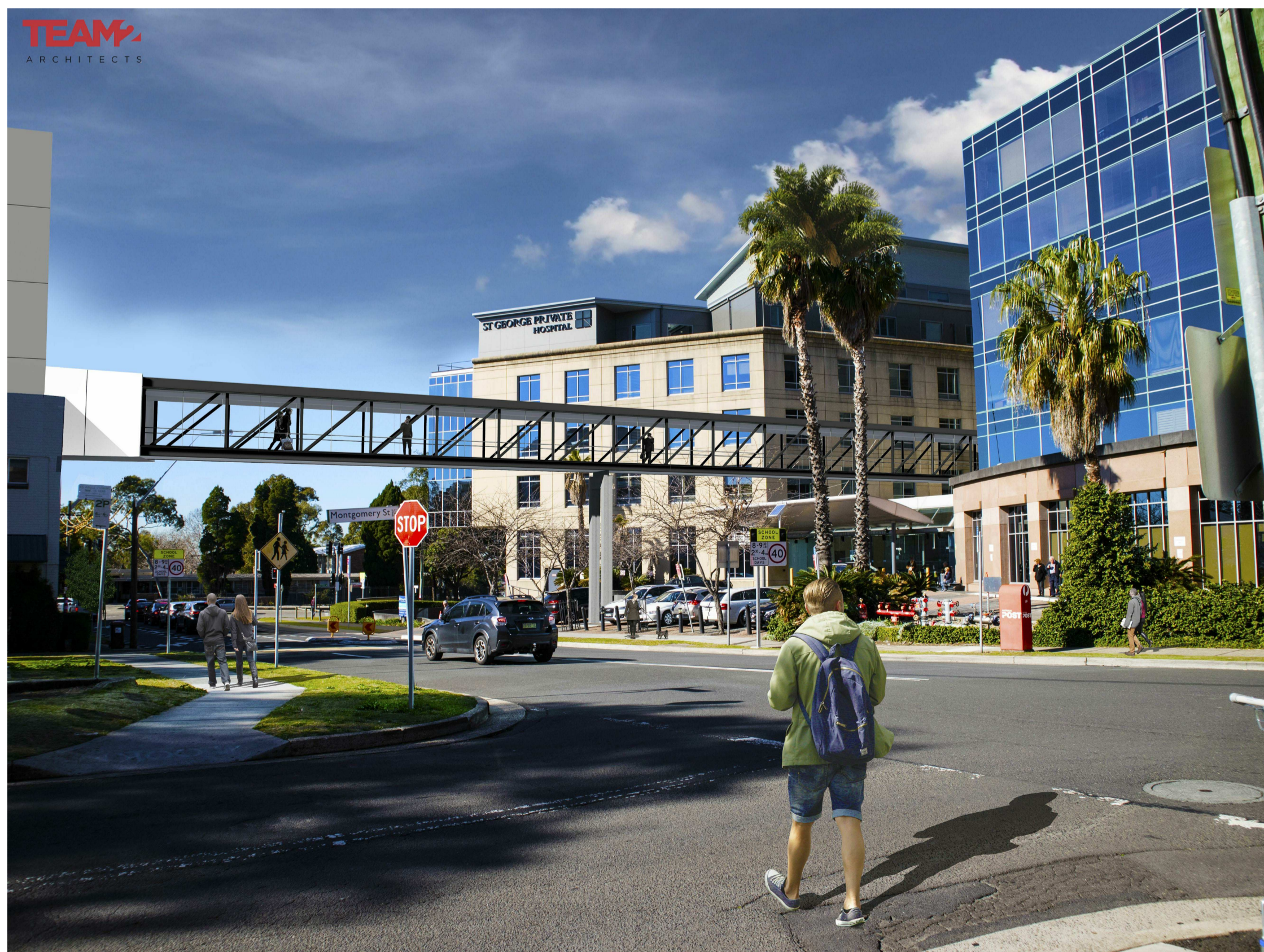
PROPOSED WEST PERSPECTIVE OF BRIDGE LINK - NTS.