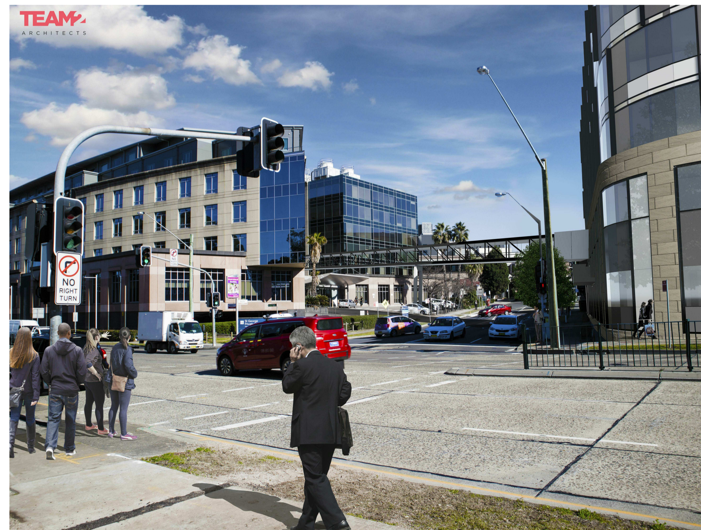
PROPOSED EAST PERSPECTIVE OF BRIDGE LINK - NTS.